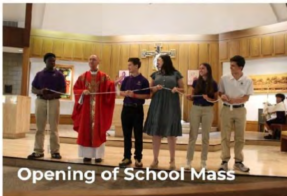
Opening of School Mass