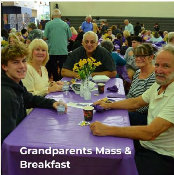
Grandparents Mass & Breakfast