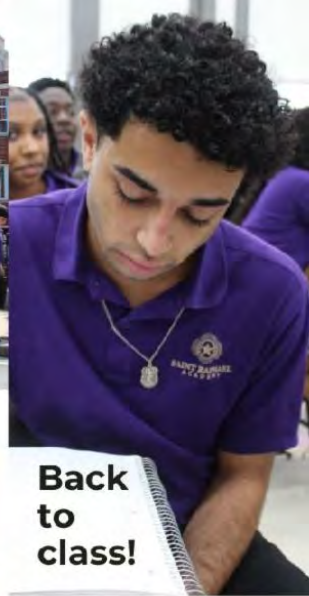
Back to class!