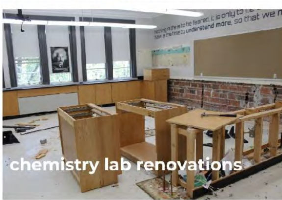
chemistry lab renovations