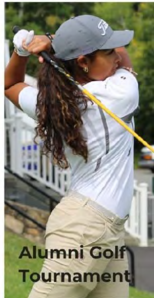
Alumni Golf Tournament