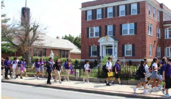
1st walk down Walcott Street