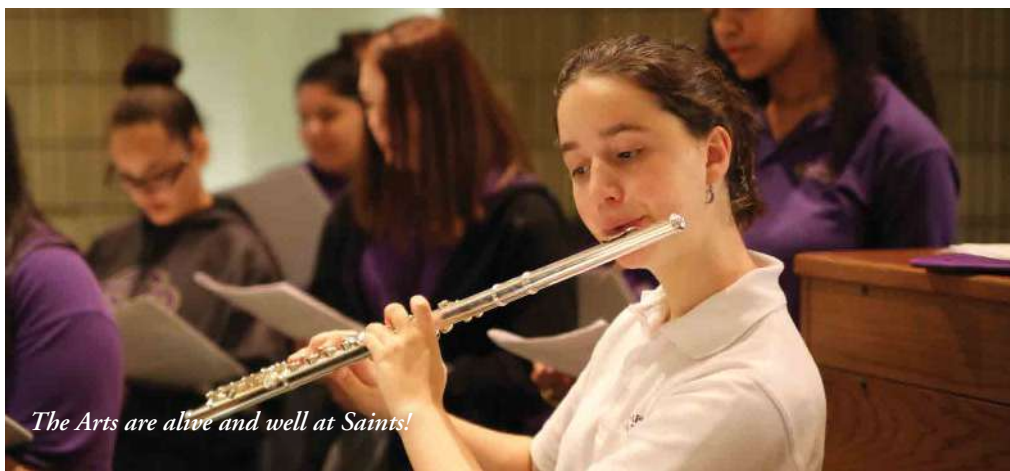
The Arts are alive and well at Saints!