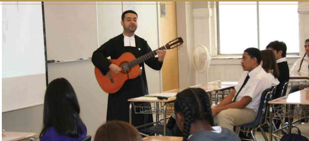
Lasallian Brothers visited campus in the fall to talk about vocations.