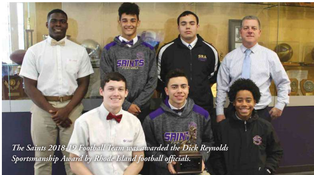
The Saints 2018-19 Football Team was awarded the Dick Reynolds Sportsmanship Award by Rhode Island football officials.