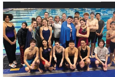
Boys and Girls State Swim Champions