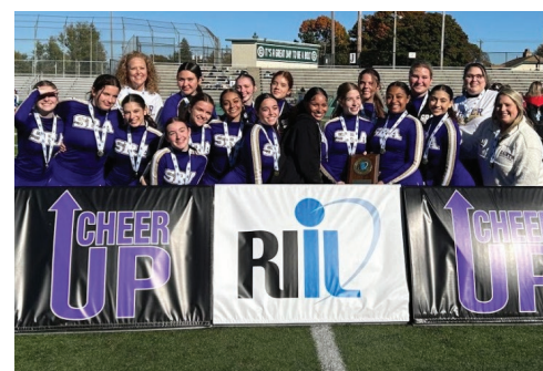
Game Day Cheer State Champions