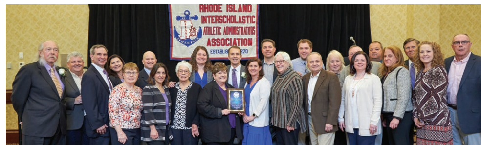
RIIAA Awards Banquet