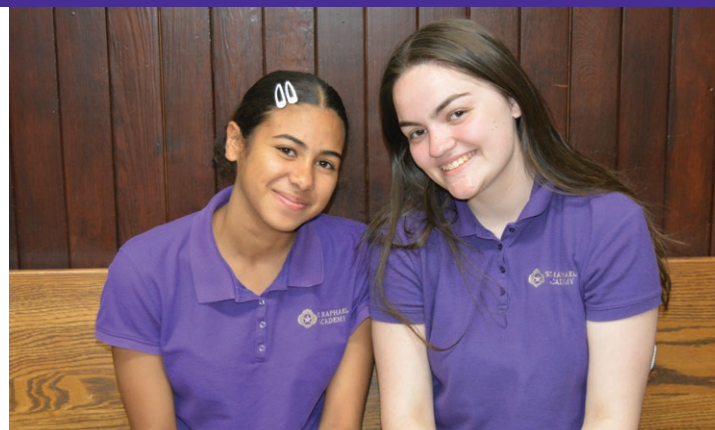
Pawtucket Teen Hall of Fame