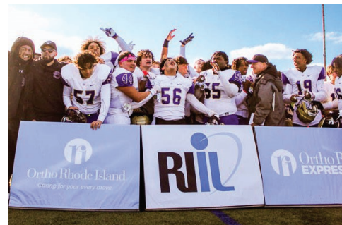
Football State Champions