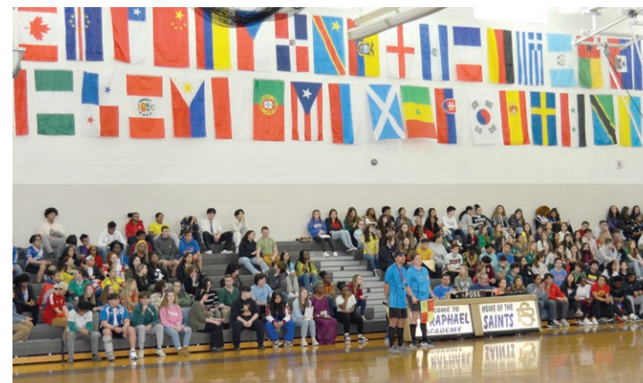
Cultures Club Pep Rally