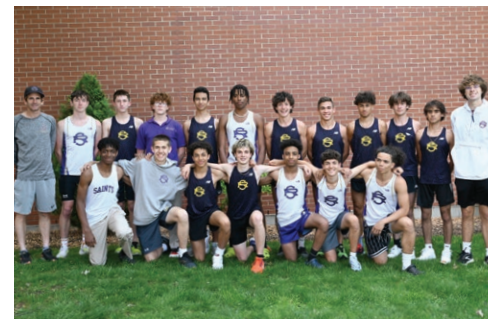
Boys Outdoor Track State Class C Champions