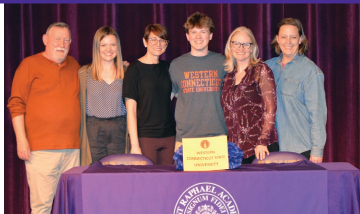
Performing Arts Signing Day