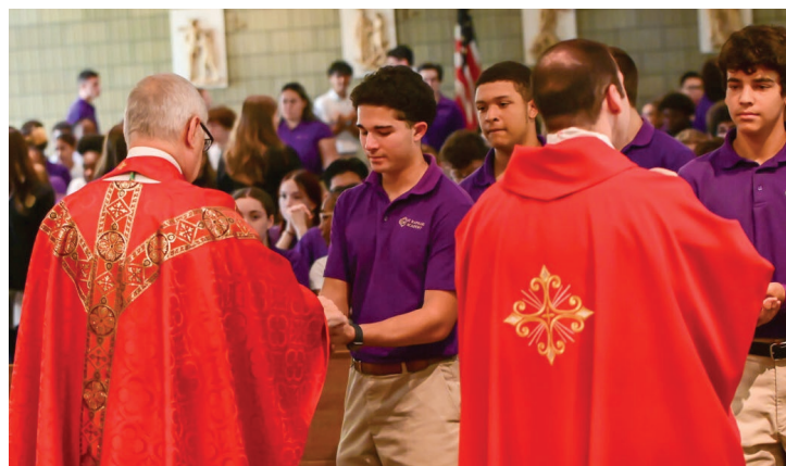
Mass with Bishop Tobin