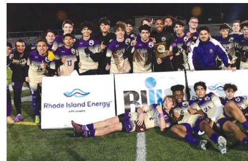
Boys Soccer State Champions