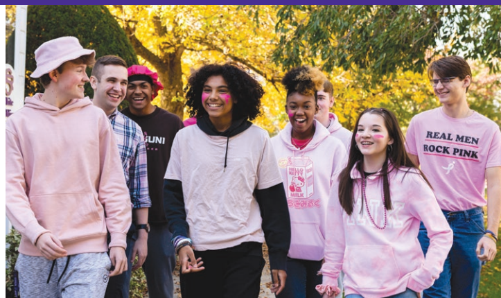
Spirit Week Pink Out Day