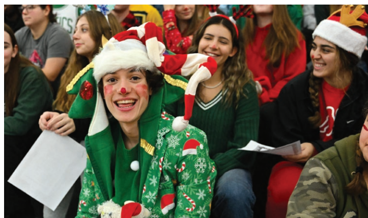
Christmas Pep Rally